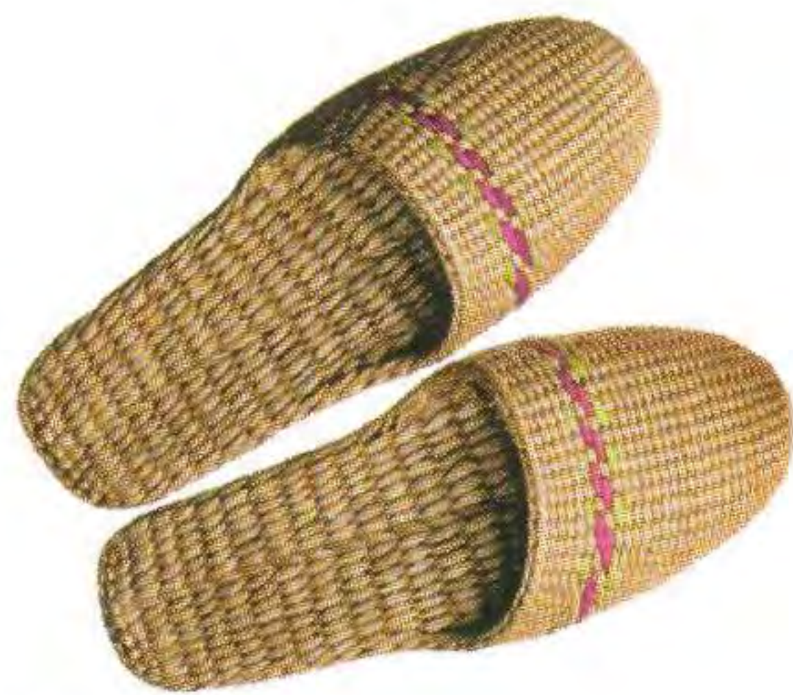
Jute slippers The Nature's Co ₹375