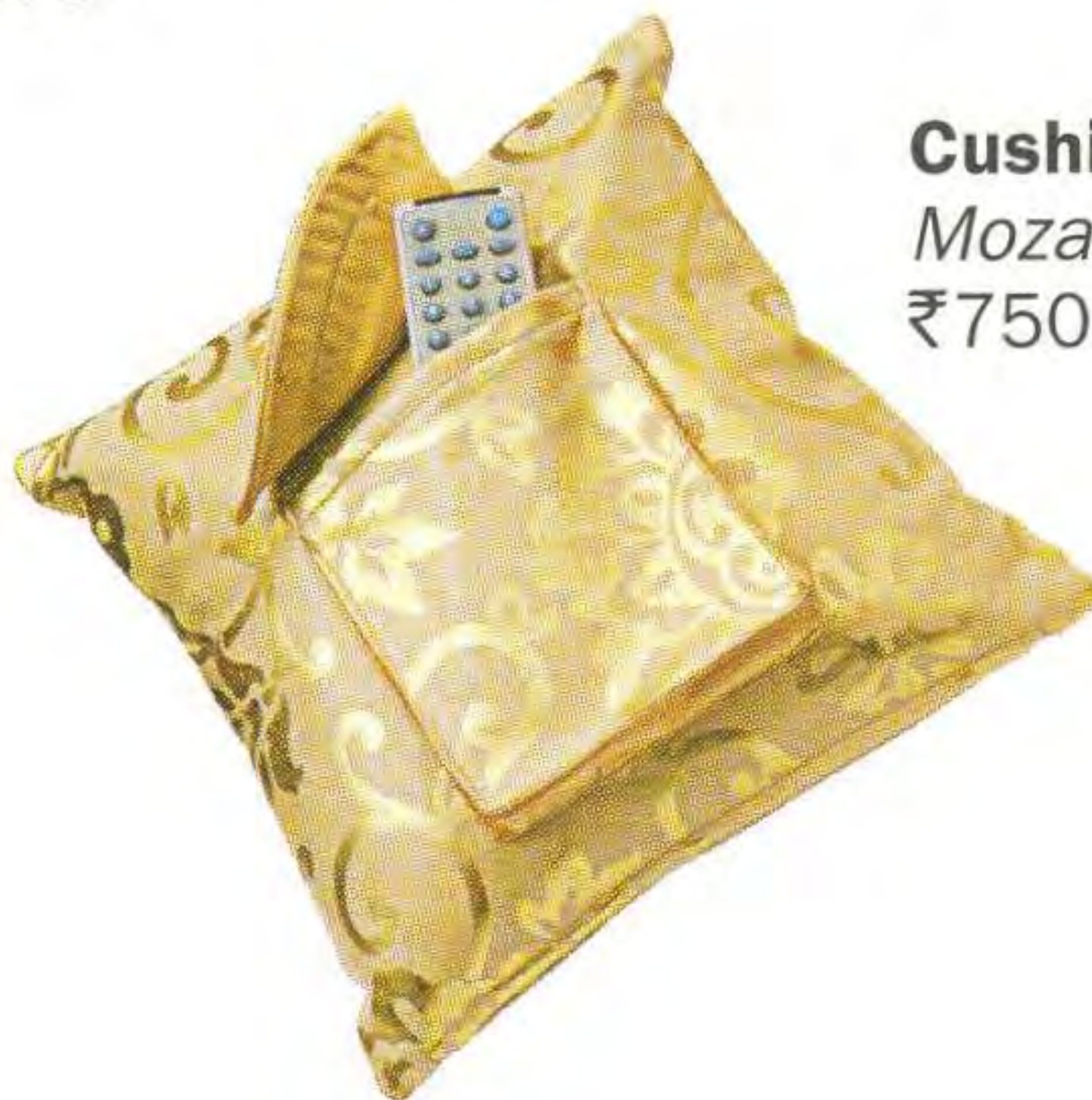
Cushion cover Mozaic ₹750