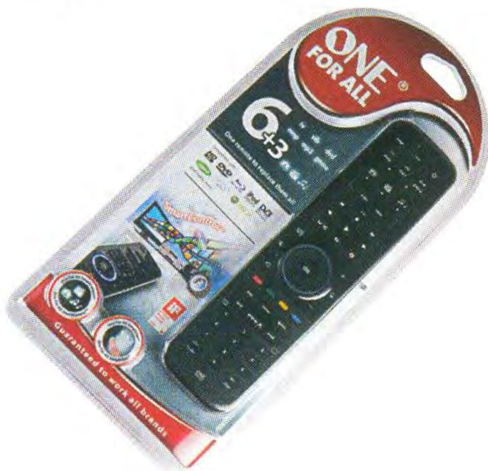
Universal remote Hypercity ₹1,490