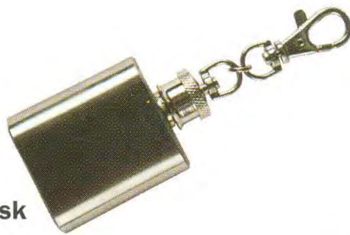
Mini hip flask Premsons ₹95