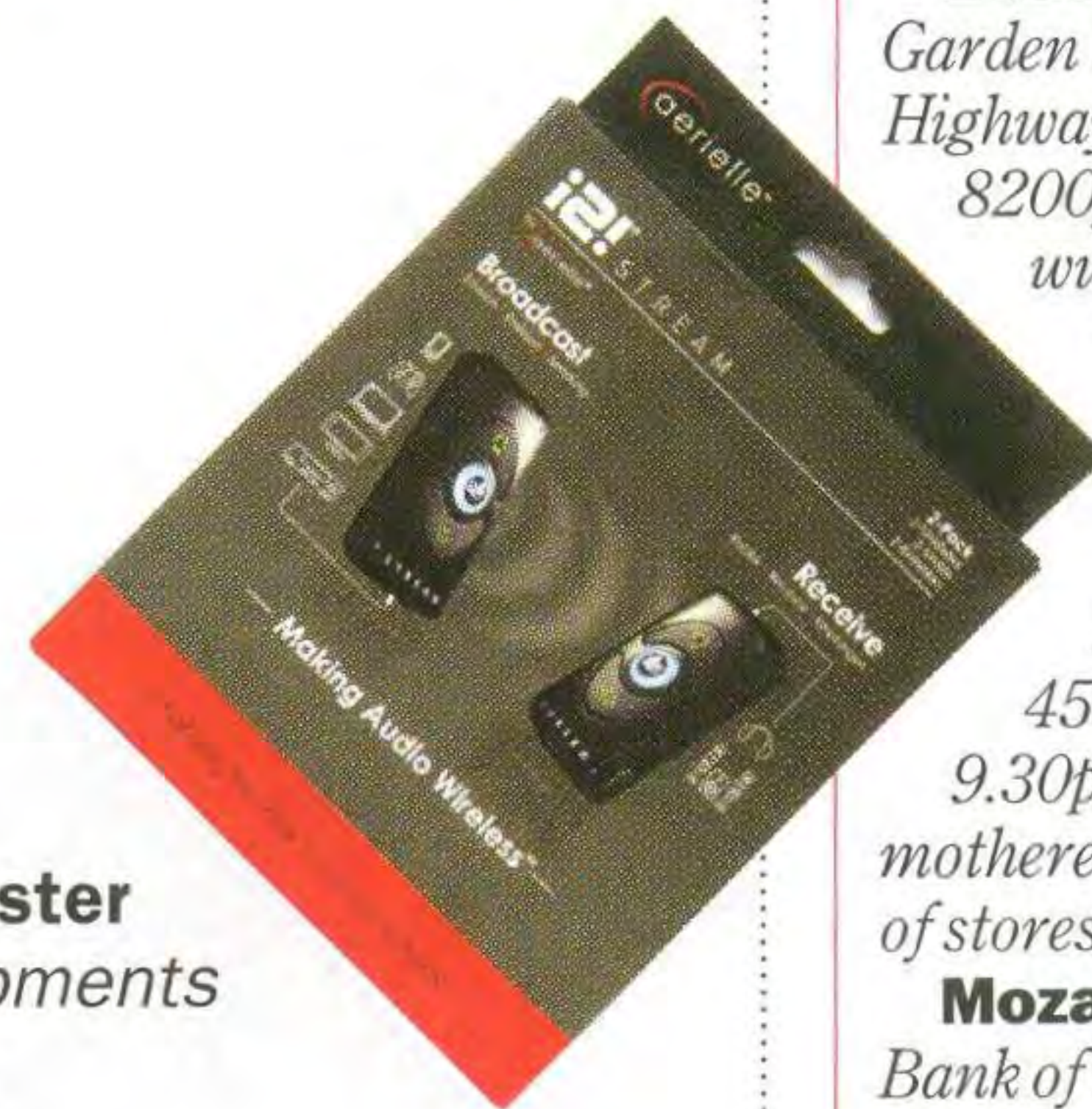
Audio broadcaster JS Equipments ₹8,250