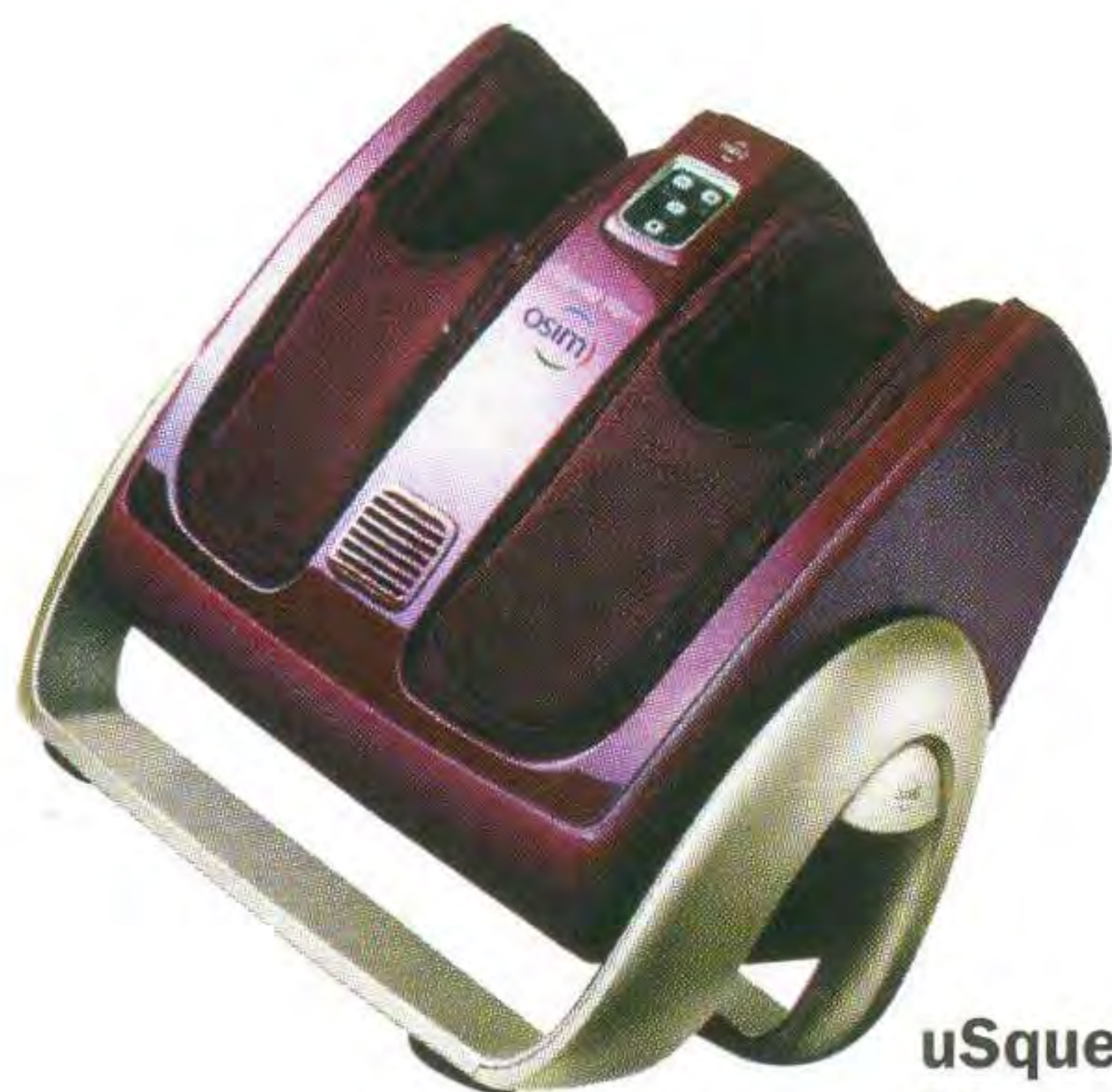
uSqueeze Warm Foot Massager Osim ₹37,000