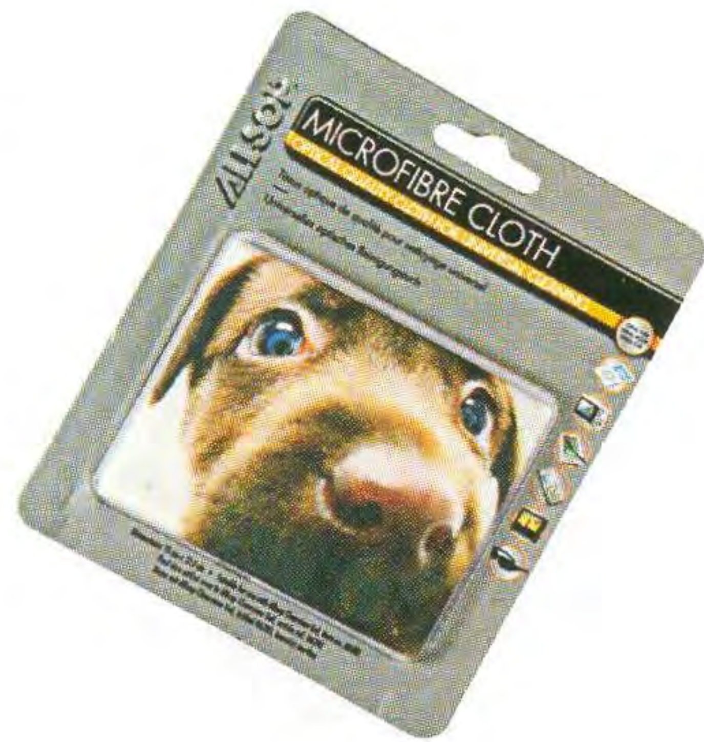
TV screen cleaner JS Equipments ₹350