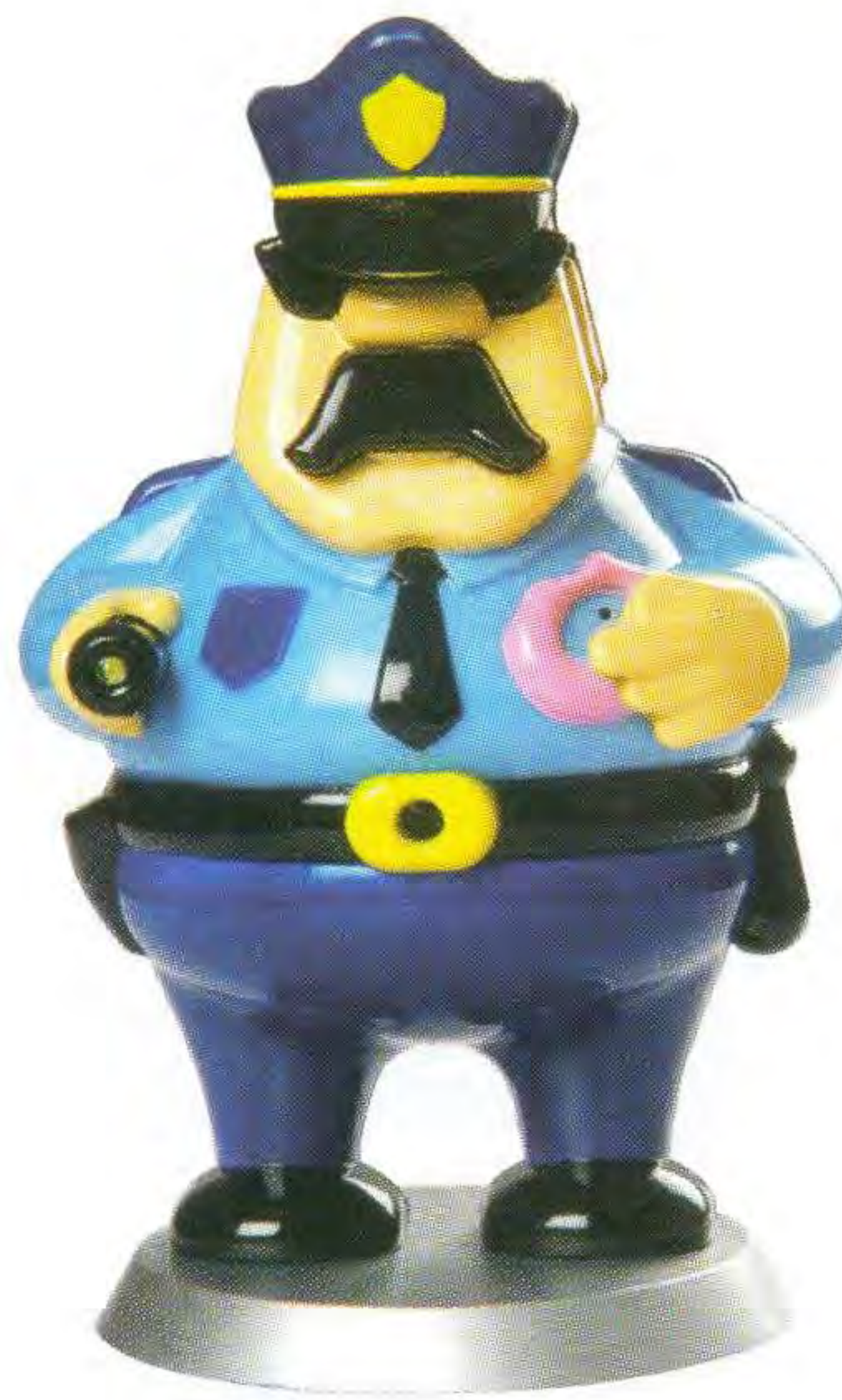
Fridge Patrol Hit Play ₹999