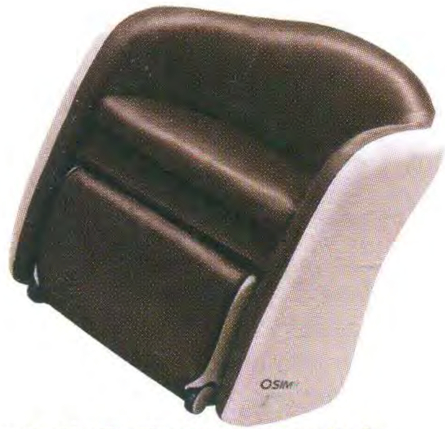
uSoffa Petit massage chair Osim ₹69,000