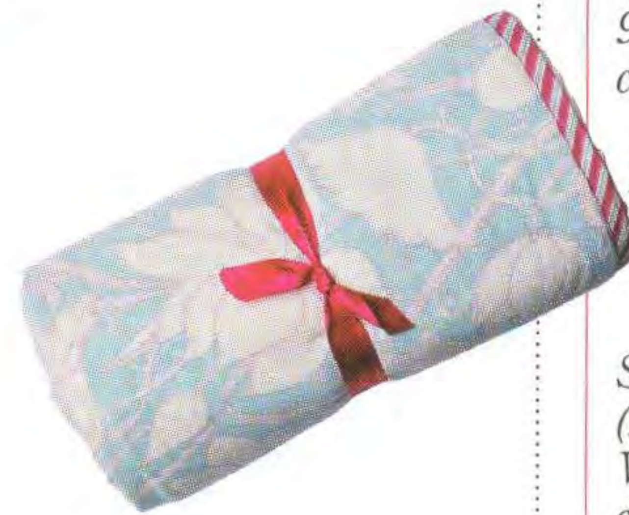
Cotton wrap Good Earth ₹2,400