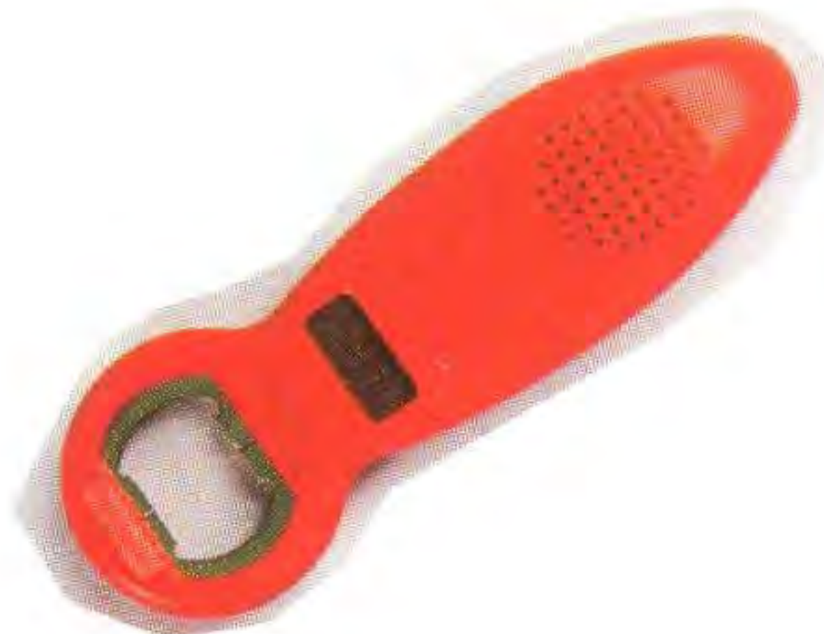
Beer tracker opener Hit Play ₹799